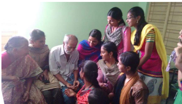
Old age Home visit