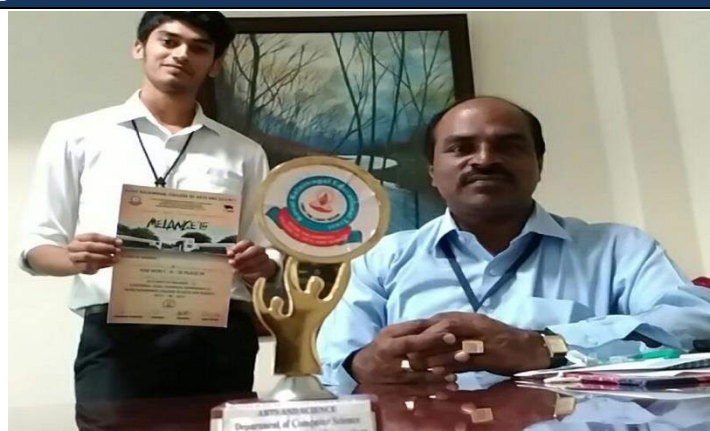
Winner in Technical Symposium