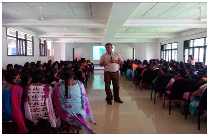
Guest Lecture @ Bio Sciences