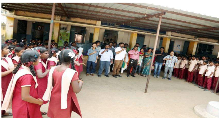
World Literacy Day @ Govt. School