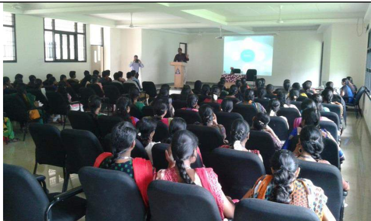
Guest Lecture @ Mathematics