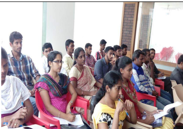
Seminar @ MIB