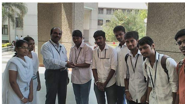
Peace for Wealth