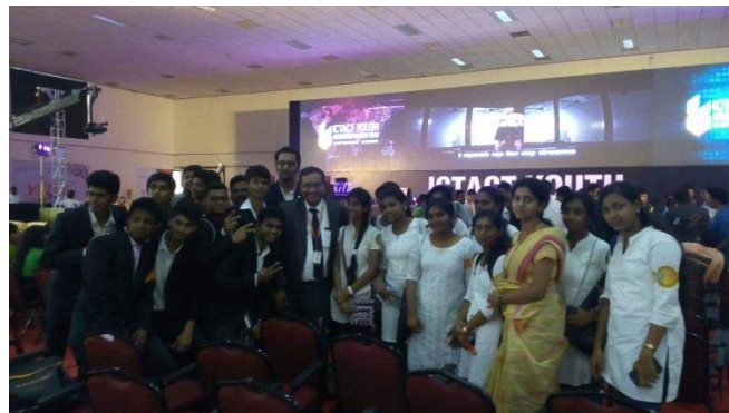
CS Streams @ CODISSIA