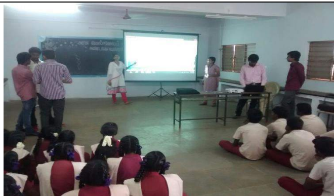
Digital Campaign @ Govt. School