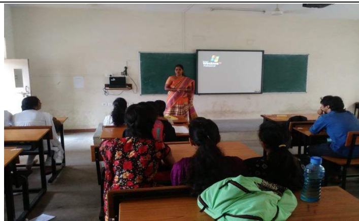
GFMP Programme@ Commerce & BBA