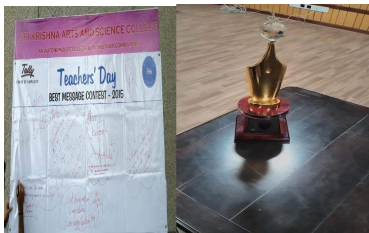
Teacher's Day- 05.09.2015