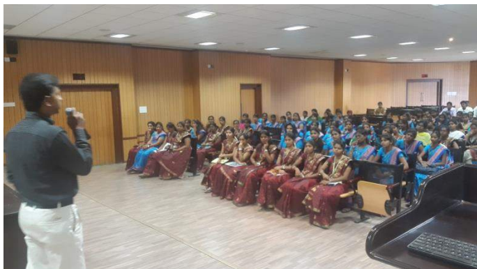
Seminar @ BCA &M.Sc (SS)