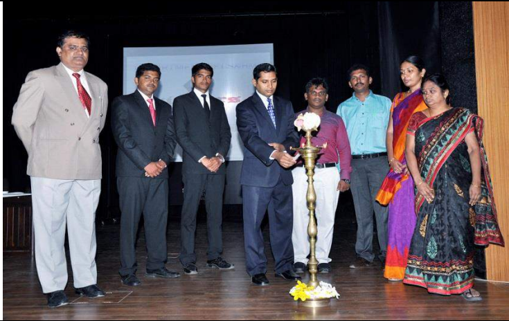
CSHM – 16.09.2015