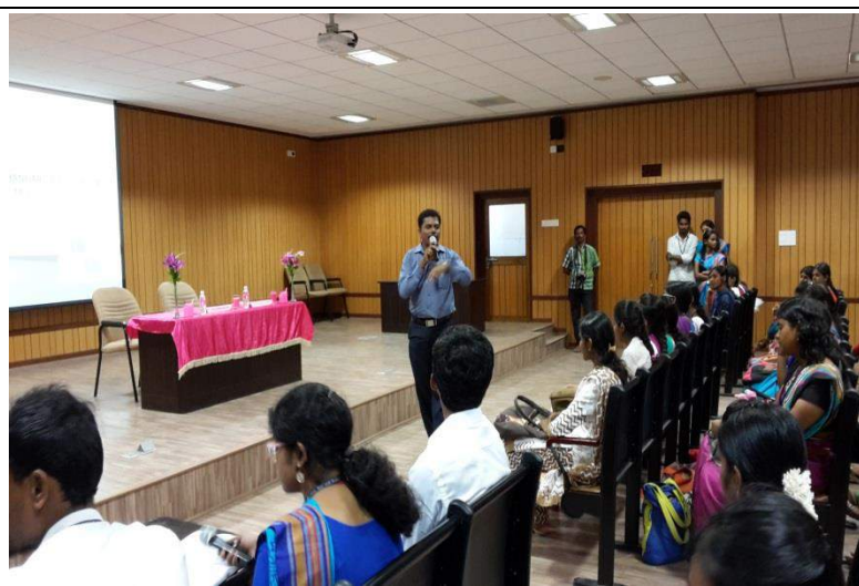
Workshop @ Commerce