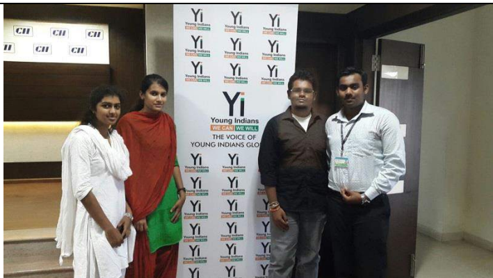
BBA & BBA Students @ Codissia