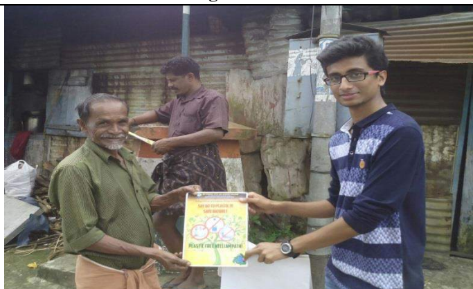
Plastic Eradication @ Nelliampathy