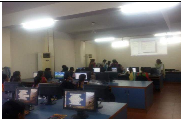
Seminar @ CT