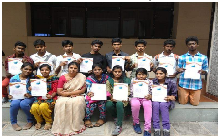
Runners in Kalloori Salai