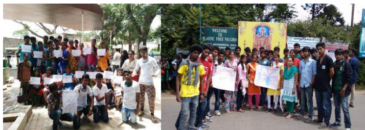
Green India Awareness Programme