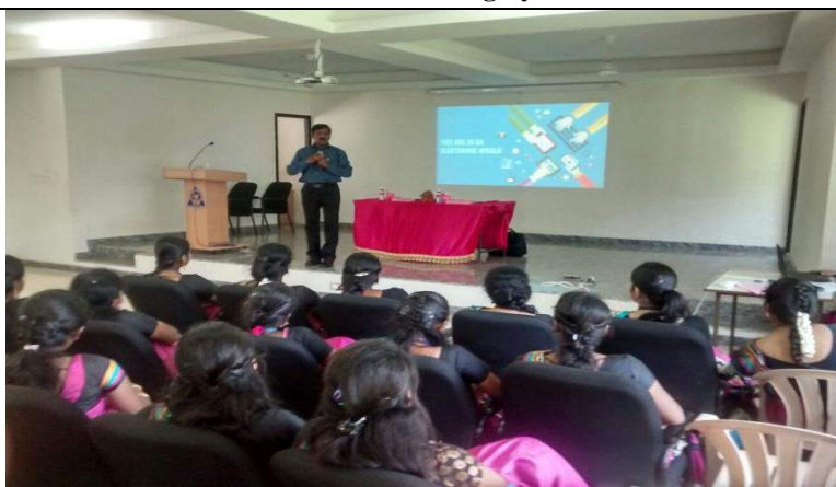
Guest Lecture @ Commerce (CA)