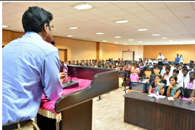
Alumni Interaction @ Commerce (ABC)