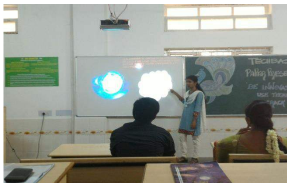
Paper Presentation @ Sakthi Engineering