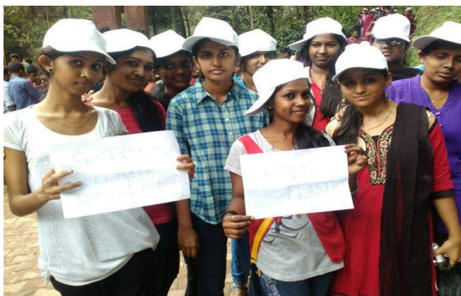
Plastic Eradication @ Coorg by Mathematics