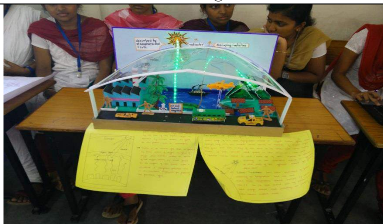
Eiternia'15 @ CS