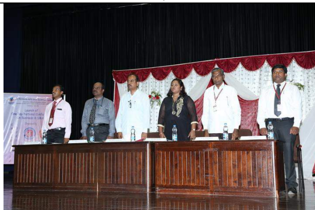
National Conference @ Management