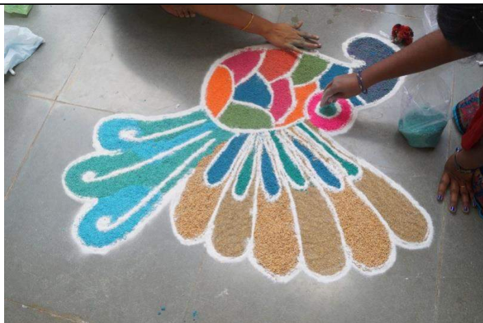
Art Feast @ IT