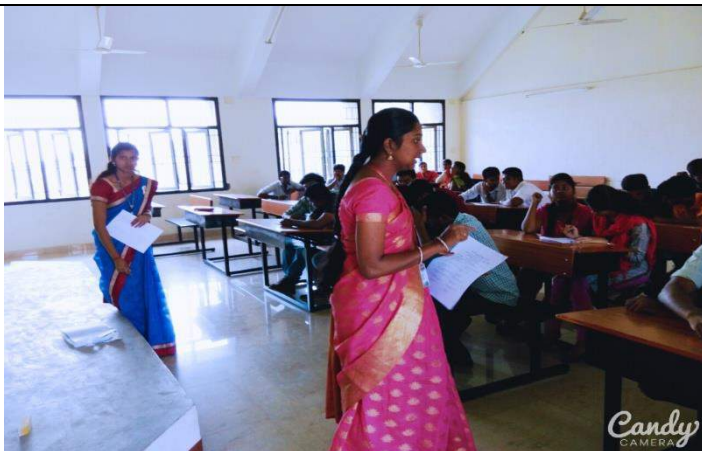
Edutainment @ CSHM