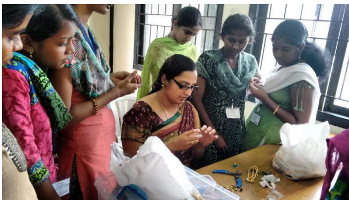
Workshop @ CDF