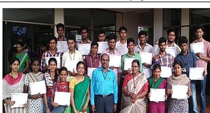
Paper Presentation @ Kodaikanal