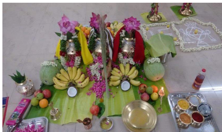
Devotional Programme@ SKIM Block