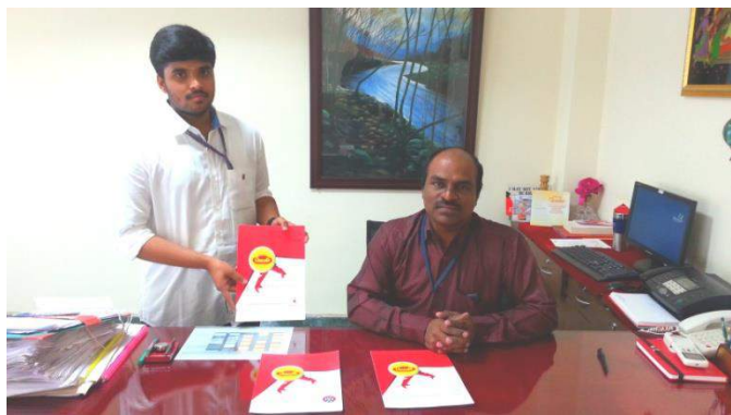
Skill Based Training and Select for abroad study