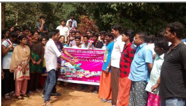
Digital India Campaign @ Nelliampathy