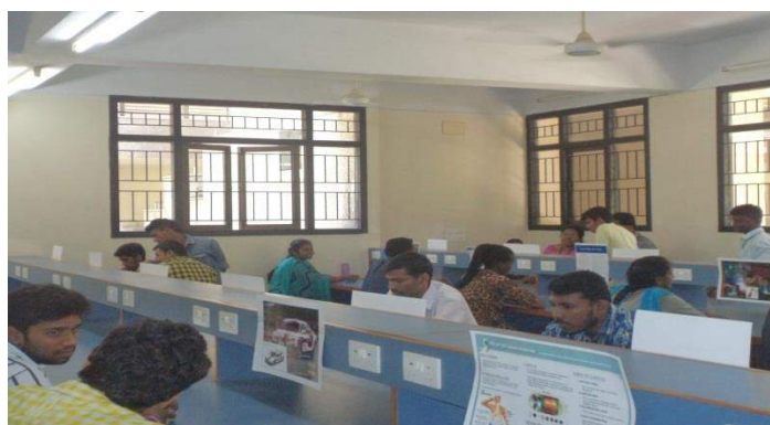
Poster Presentation @ ECS