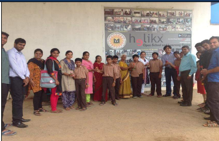
Blood Donation Awareness Programme - 04.09.2015