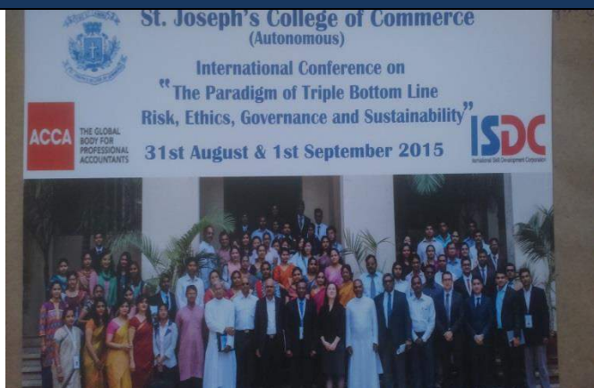
Commerce Students @ Bangalore