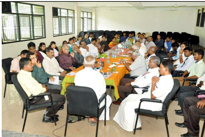
National Policy for Older Person