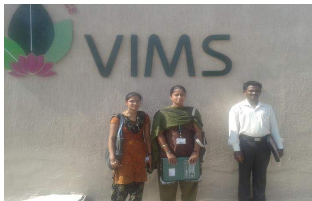
Faculty Development Programme