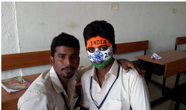
Intra Departmental Event @ CSA & B.Sc(SS)