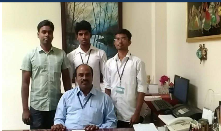
Gold Medal Winners –Boxing