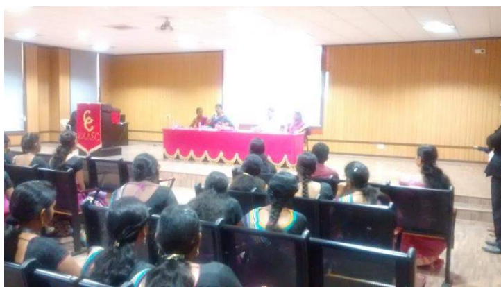
Math Modeling @ Mathematics