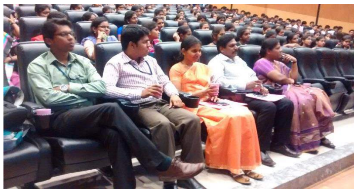
Workshop @ Commerce (CA)