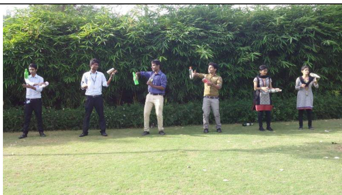
EVS Exhibition @ CT