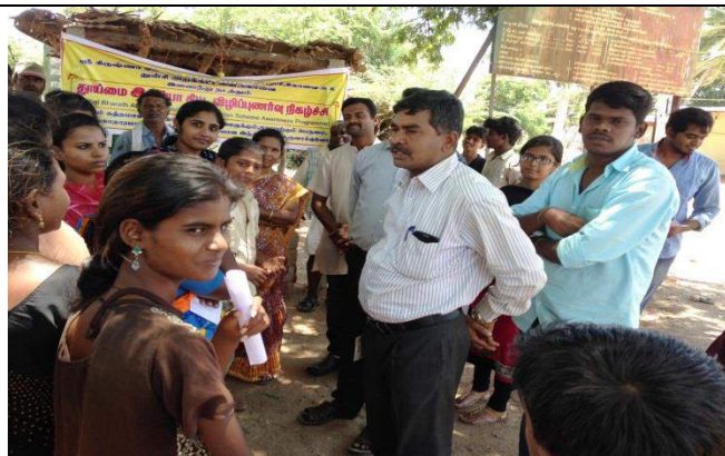
Cleanliness Camp - 12.09.2015