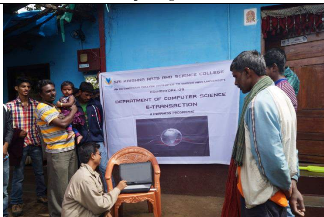
e-Transaction Awareness @ Nilgiris