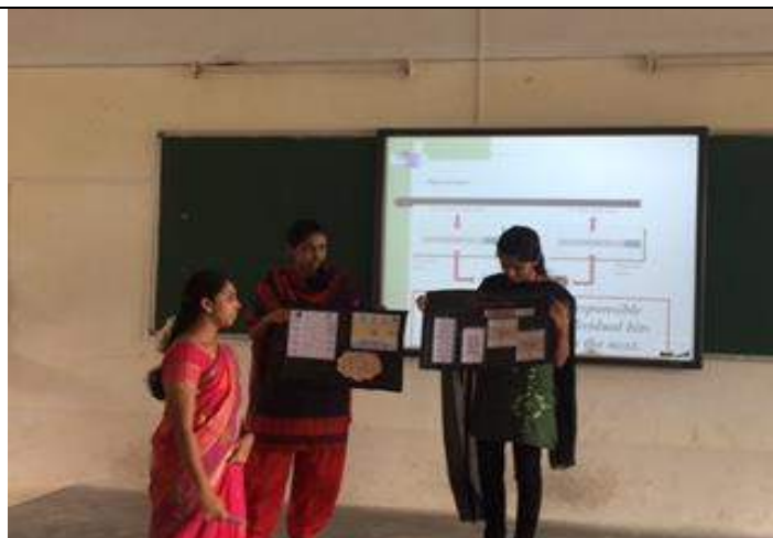
Smart Teaching (Edutainment)