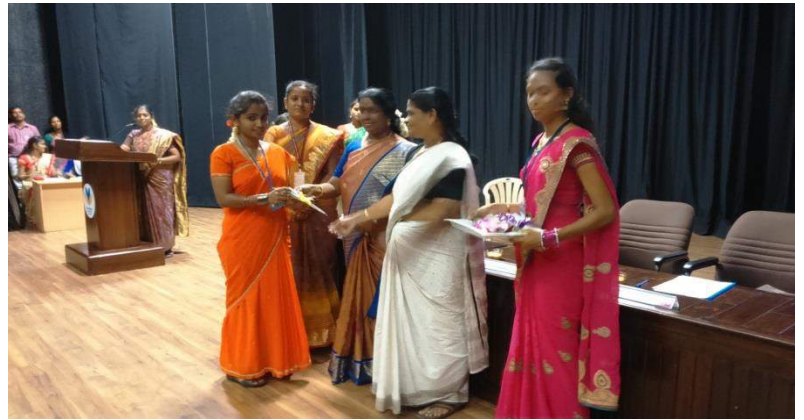
Women's Cell – 18.09.2015