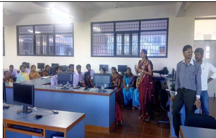
Workshop @ BCA & M.Sc(CS)