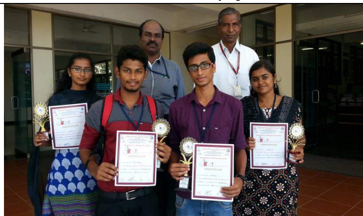
Winners in Technical Symposium