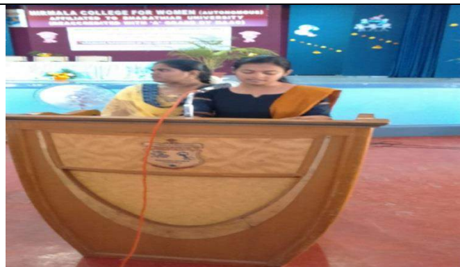
Paper Presentation @ Nirmala College