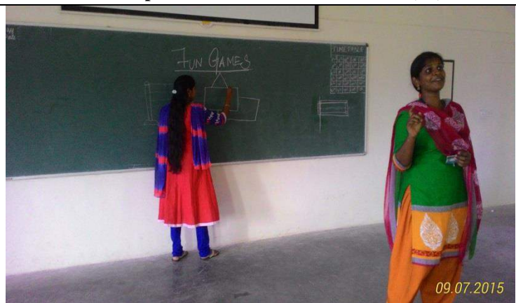
Math Sketching @ Mathematics