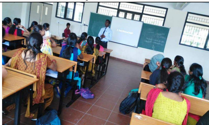
Guest Lecture @ CDF