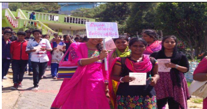
Financial Literacy @ Nilgiris