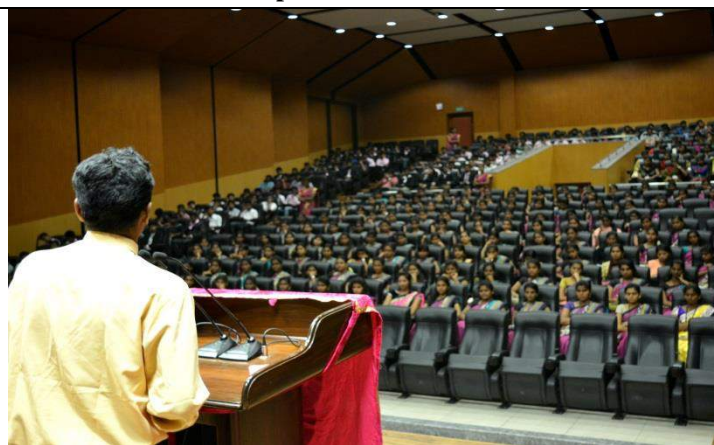
Seminar @ Commerce (ABC)