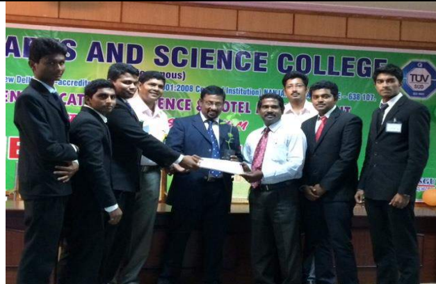
Symposium @ Kongu Arts