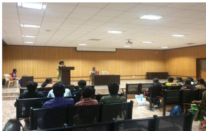
Poster Presentation @ MB