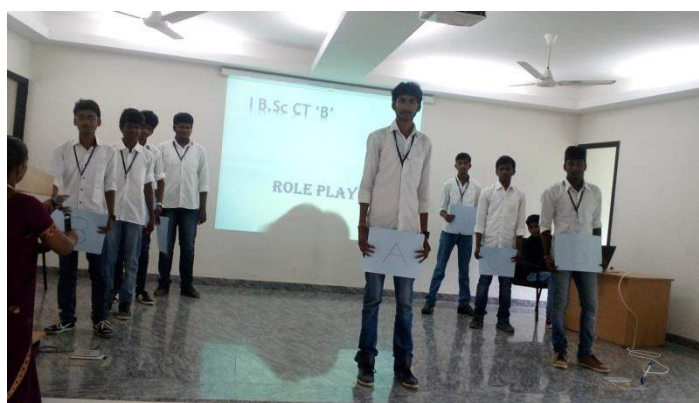
Role Play @ CT