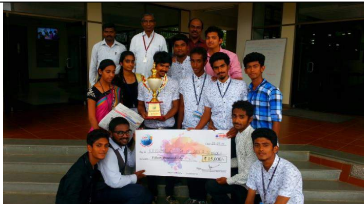
Winners in Kalloori Kaalam