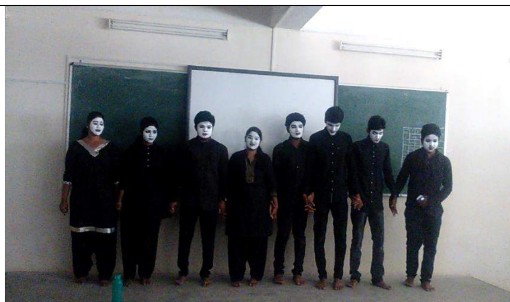
Intra-Departmental Event @ CT