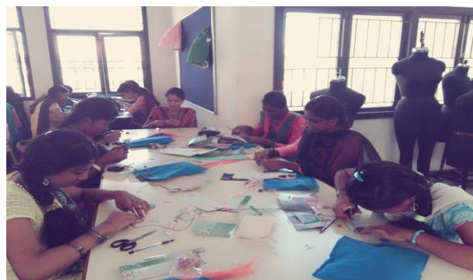
Workshop @ CDF