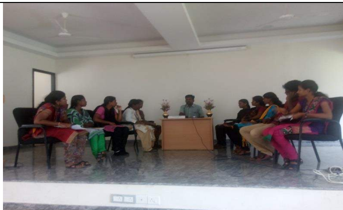
VivadhaMedai@ Tamil Mandram