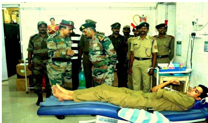
Blood Donation Camp by NCC