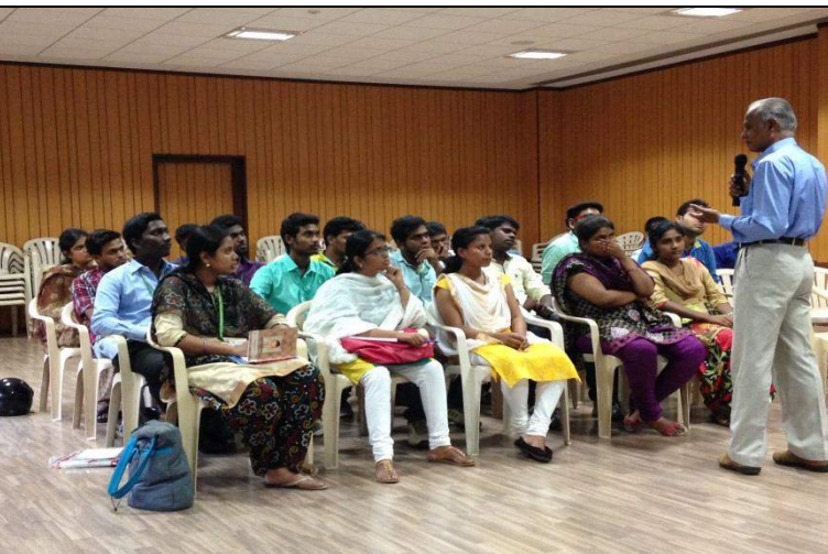
Guest Lecture @ MSW