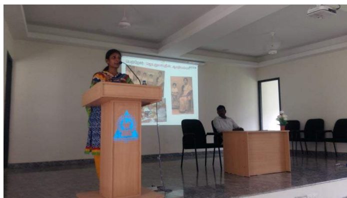
NoolMathipurai @ Tamil Mandram