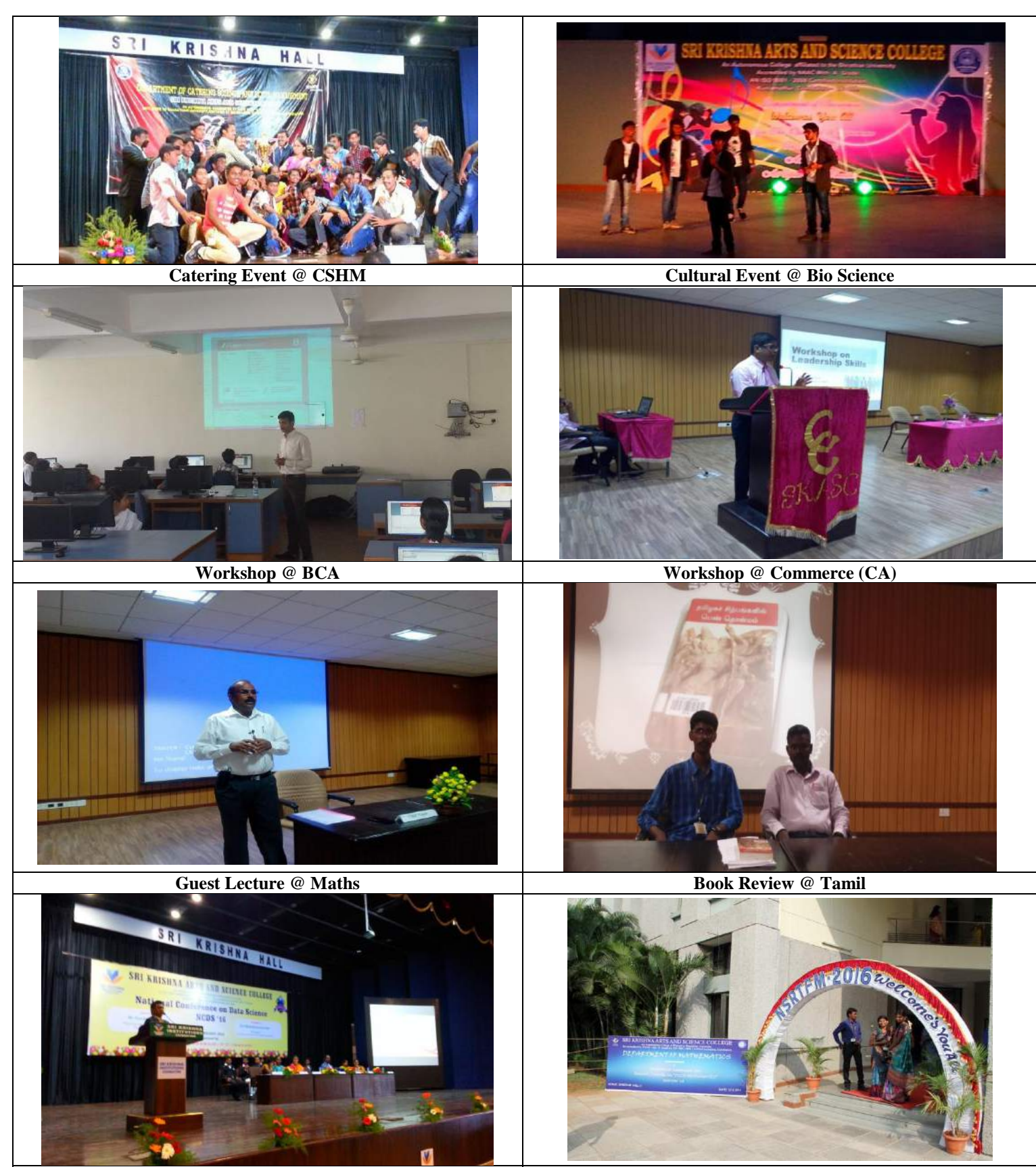
National Conference @ CS Streams