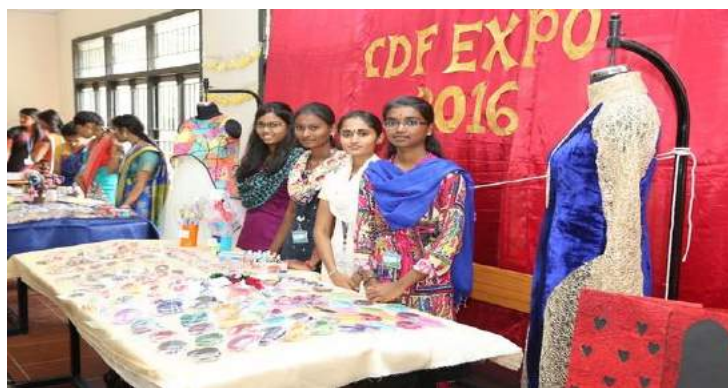
Expo @ CDF