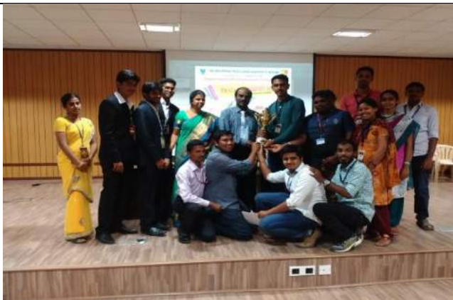
Inter Collegiate Meet @ IT