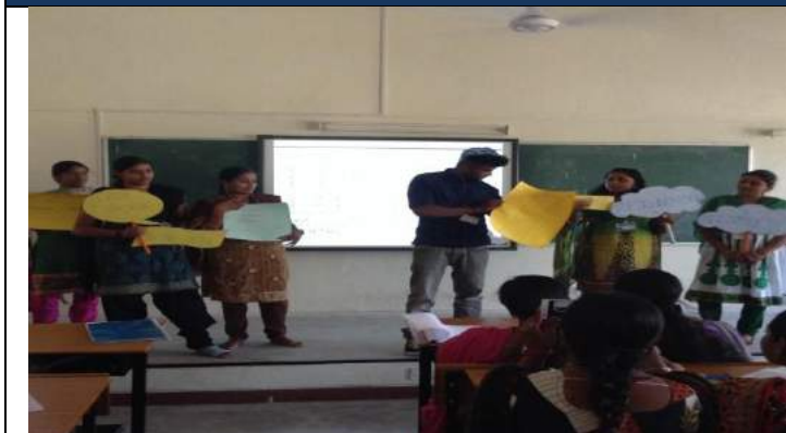
Edutainment @ CS