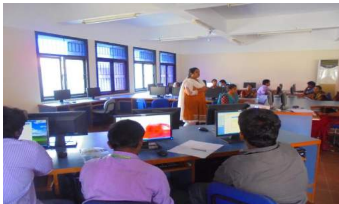
Workshop @ M.Sc (SS)