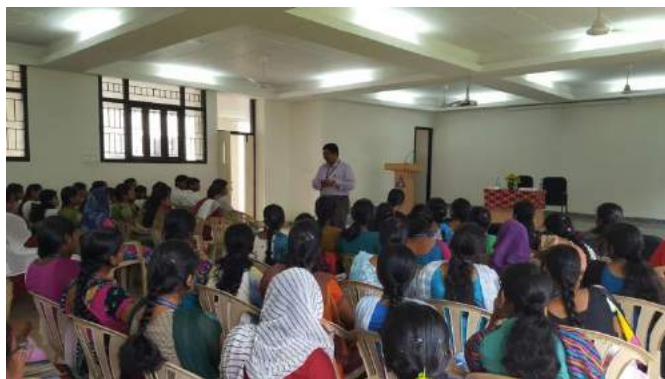
Guest Lecture @ Mathematics