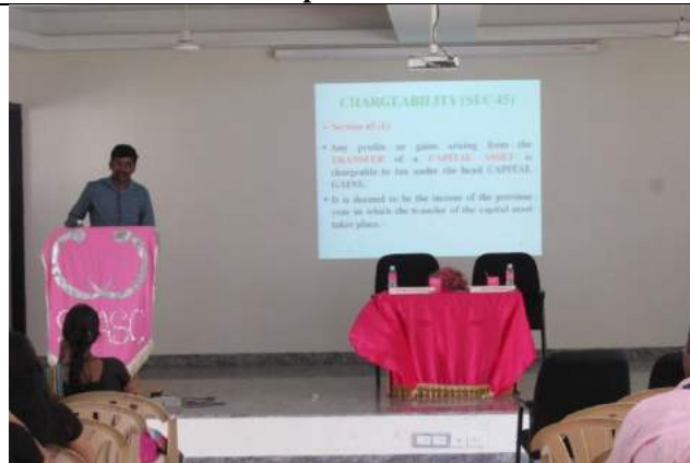
Guest Lecture @ Commerce(IT & PA)