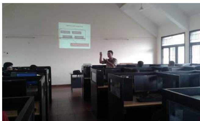
Workshop @ CS