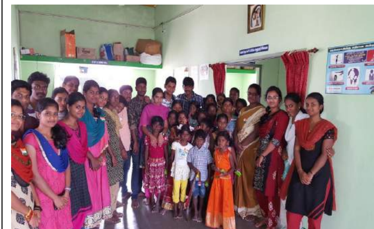
Orphanage Visit @ Chettipalayam – 26.01.2015