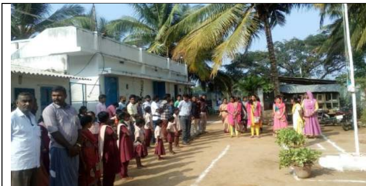
Republic Day Celebration @ Pollachi – 26.01.2016