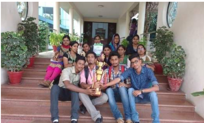
BCA & CS Students won Overall Trophy