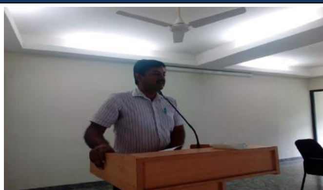
Enrichment Programme @ Maths