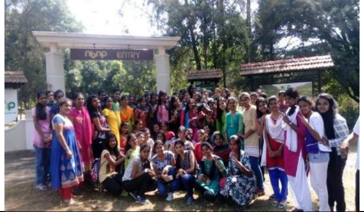
Hostel Students @ Anaikatti