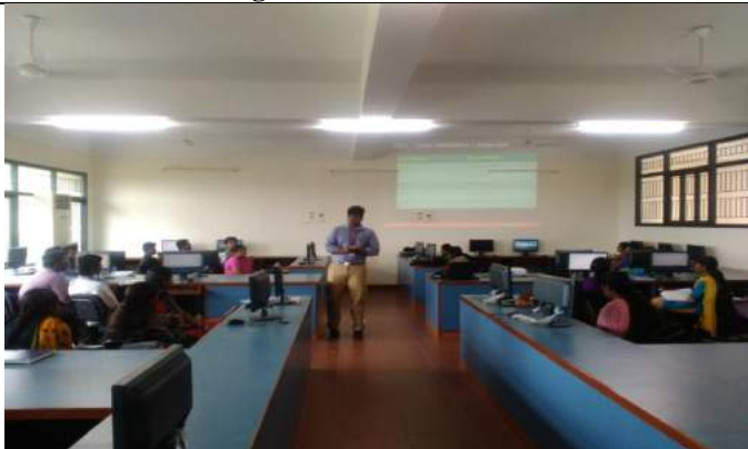
Seminar @ CS