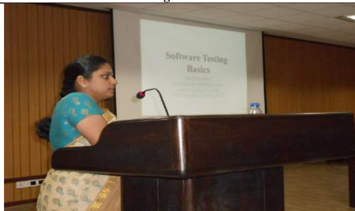
Guest Lecture @ BCA & M.Sc (SS)