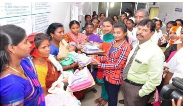
Dress Distribution @ Government Hospital – 01.01.2016