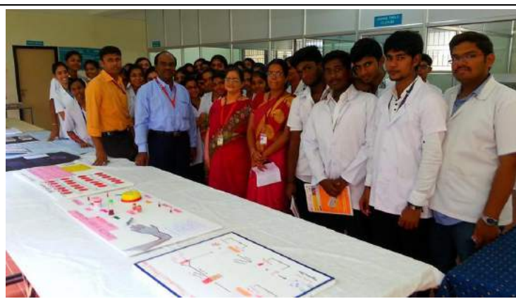
Tech Fair @ Bio Science