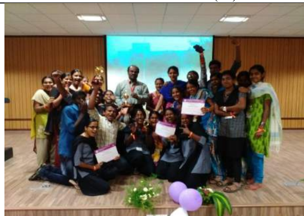
Inter Collegiate Meet @ Maths