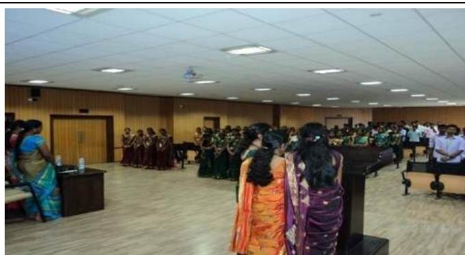
Seminar @ BCA & M.Sc(SS)