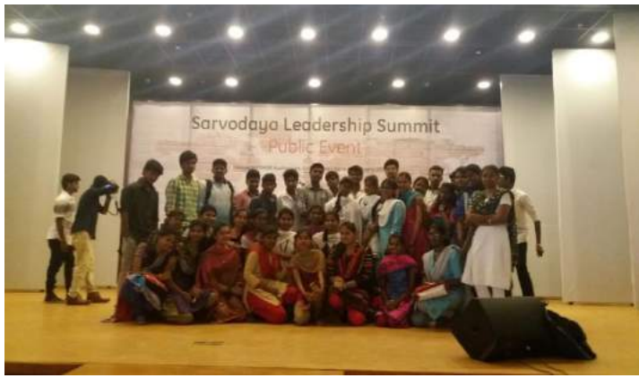
NSS Students @ PSG IM