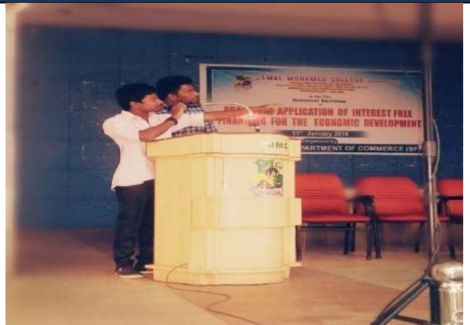
Students @ Jamal Mohammed College, Trichy