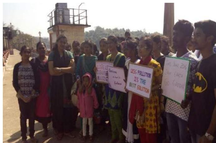
Swachh Bharat @ Malampuzha – 30.01.2016