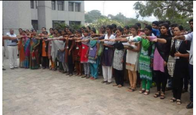
Voters Day Pledge – 25.01.2016