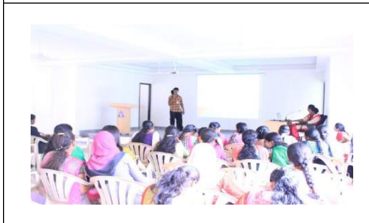
Inter Collegiate Meet @ CSA & B.Sc(SS)