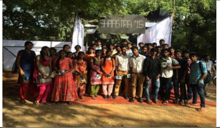
Students @ IIT, Chennai