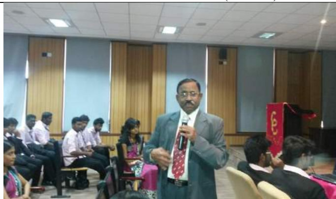
Guest Lecture @ Commerce(CA)