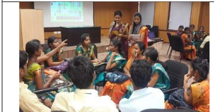
Edutainment @ BCA