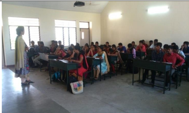
Snap Talk – 27.12.2016