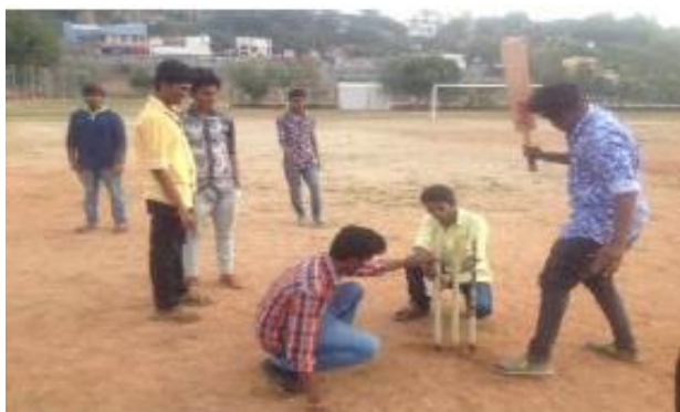
ECS Students @ Cricket Tournament – 14.12.2016