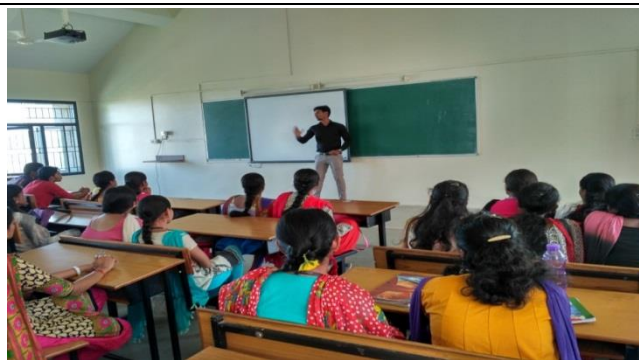
Workshop @ IT – 26.12.2016