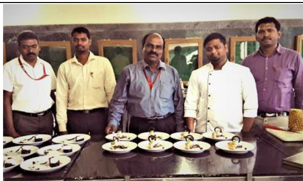
Workshop @ CSHM – 19.12.2016