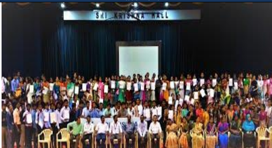
226 students placed in Infosys BPO