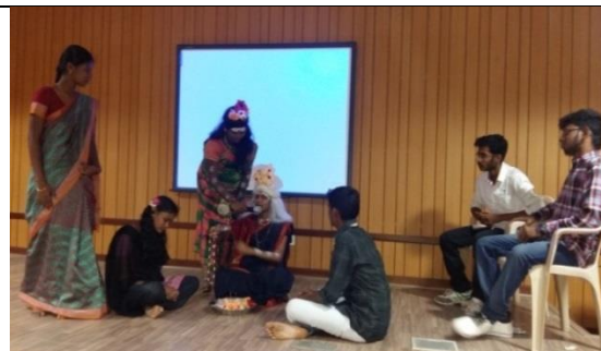
Tamil Drama I Round – 23.12.2016