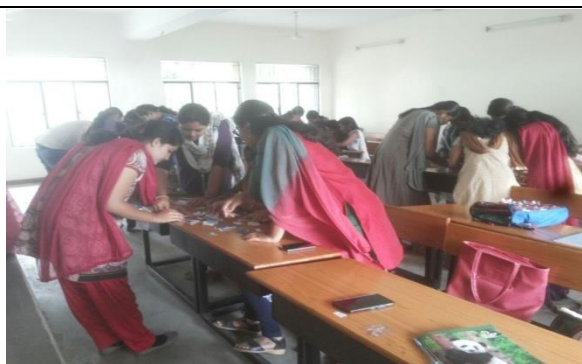
Edutainment @ Commerce BPS - 17.012.2016