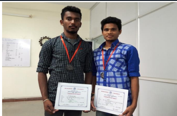
BBA Students Won Prizes @ Bharathiar University