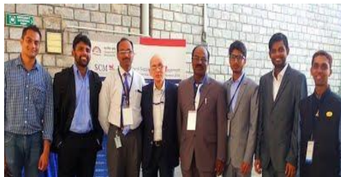
Students along with faculty presented the Research Project on Agricultural Supply Chain in IIM Bangalore– 15.12.16