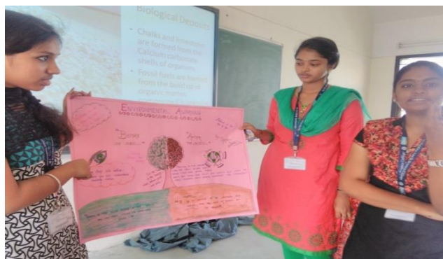
Group Activity @ CSA & SS – 30.12.2016