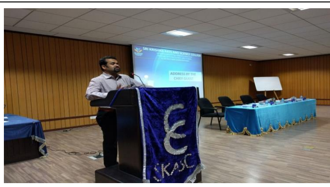
Colloquium @ Commerce CA - 29.12.2016