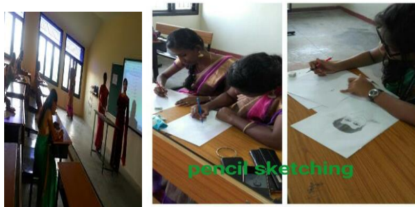
Ramanujan Day @ Mathematics - 22.12.2016