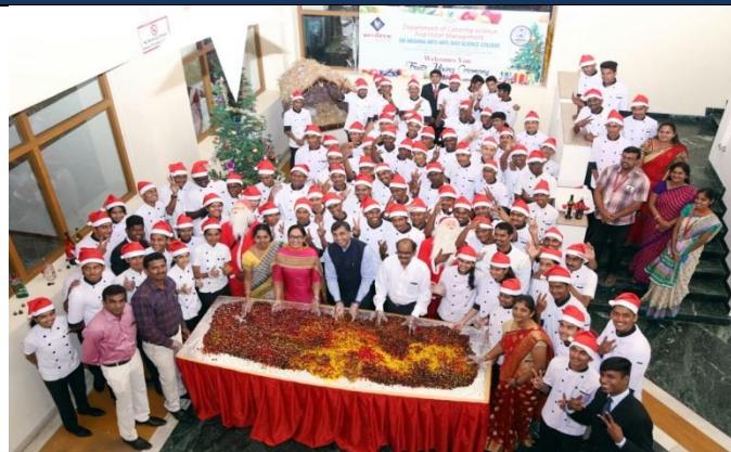
Fruit Mixing Ceremony @ CSHM – 15.12.2016