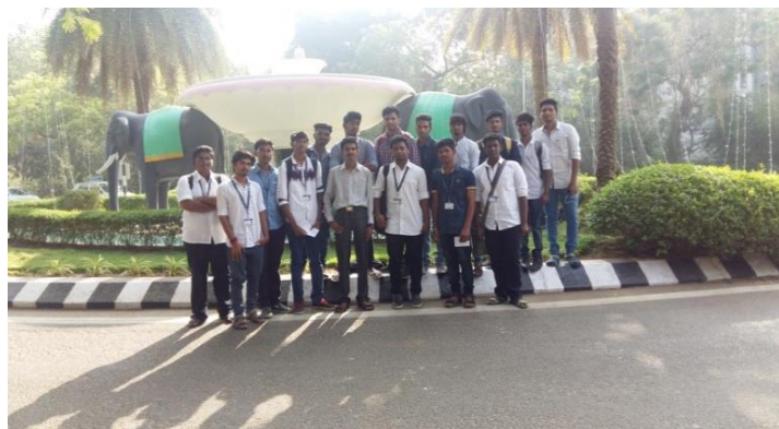
CS Students @ IIT Chennai – 30.12.2016