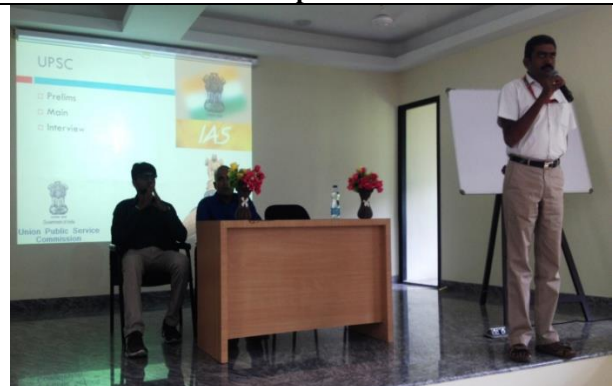
An awareness program @ ECS – 29.12.2016