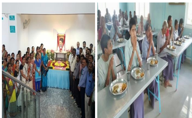
Founders's Day Celebrations @ MSW – 21.12.2016