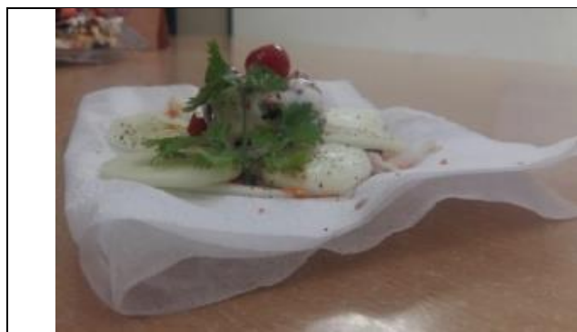
Food Lovers Event @ ECS – 15.12.2016