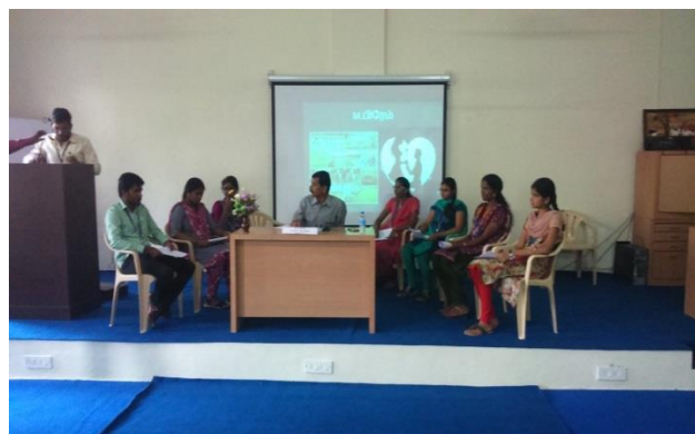
Tamil Mandram - Kavichaaral - 30.12.2016