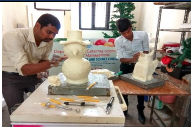
Butter carving @ CSHM – 14.12.2016