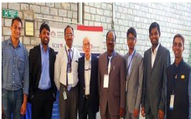
Research Project Presentation on Agricultural Supply Chain @ IIM Bangalore – 15.12.16