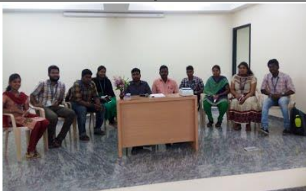
Debate @ Tamil Department – 28.12.2016