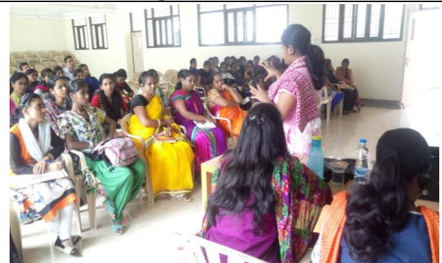
CDF Students @ Guest Lecture on CAD – 28.12.2016