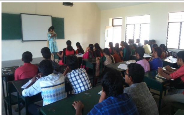
News Reading – 27.12.2016