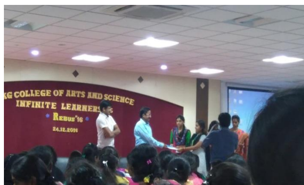
Mathematics Students @ KG College – 24.12.2016