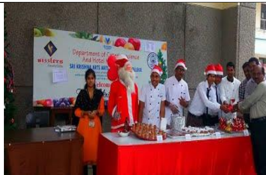
Christmas Carnival @ CSHM – 22.12.2016