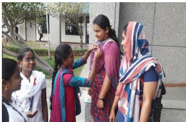
AIDS Awareness programme @ NSS – 01.12.2016