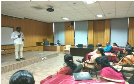
ISRO Scientist Visit – 26.12.2016