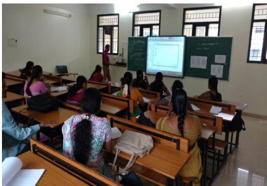
FDP on .Net Framework @ CS – 10.12.16