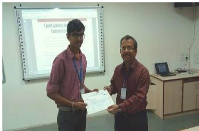
Commerce student @ MICA, Ahmedabad– 27.12.2016