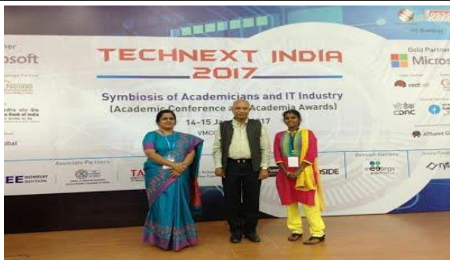
CS Faculty @ IIT Bombay – 14.01.2017