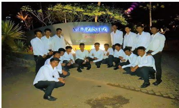
CSHM Students @ Taj Vivanta , Thiruvananthapuram – 03.01.2017