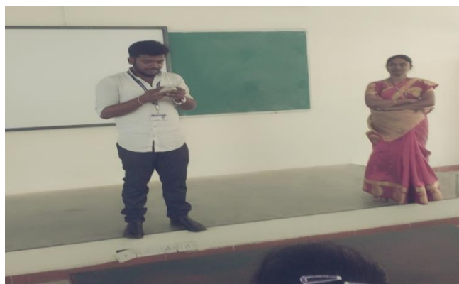
Student @ News Reading – 04.01.2017