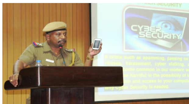
Seminar @ ECS – 12.01.2017