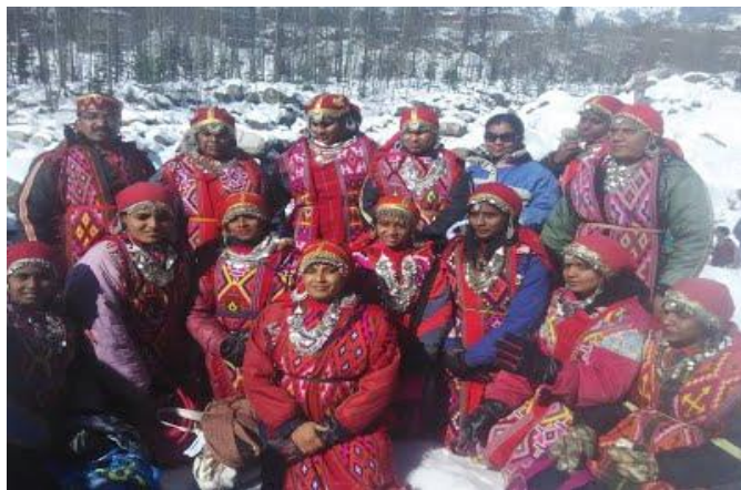
Commerce Department Faculty @ Manali– 12.01.2017