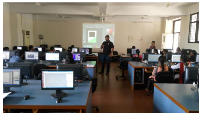
Photoshop Hands on Training @ CS – 07.01.2017