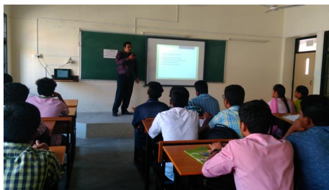
JAVA Seminar @ IT – 06-01-2017