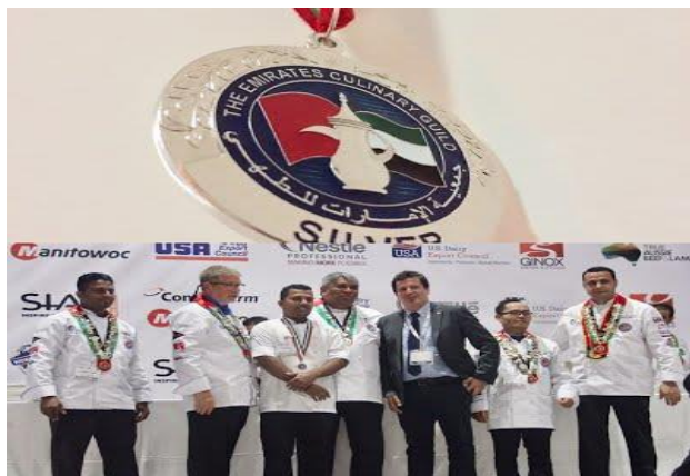
CSHM Alumni won "Emirates Culinary Guild" Award @ Dubai – 01.01.2017