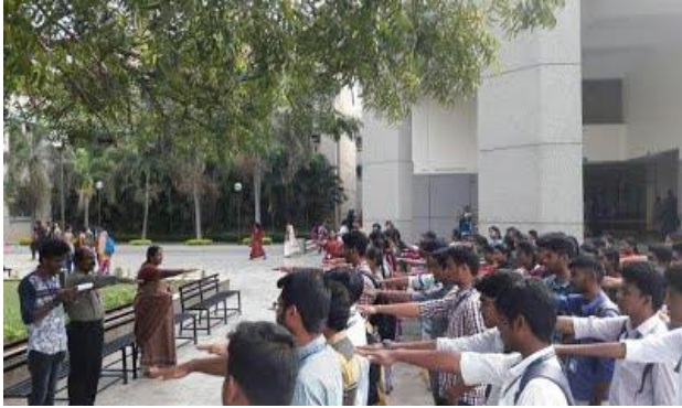
Voter's Day Pledge – 25.01.2017