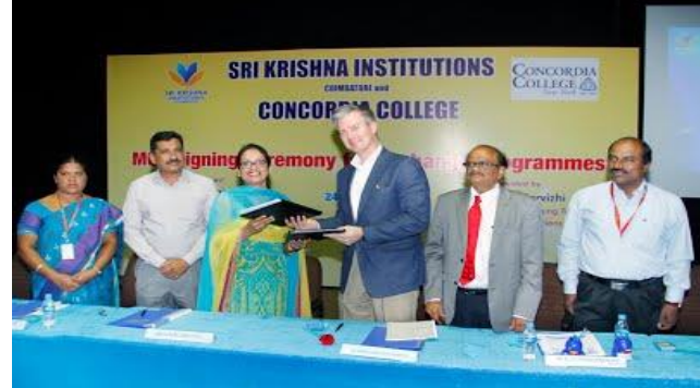
Sri Krishna Institution MoU with Concordia College of New York– 24.01.2017