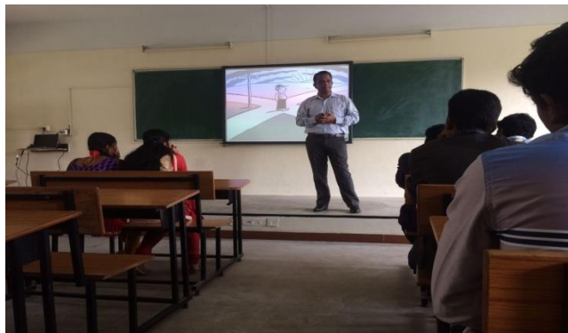
Career Guidance Programme @ CS 06.01.2017