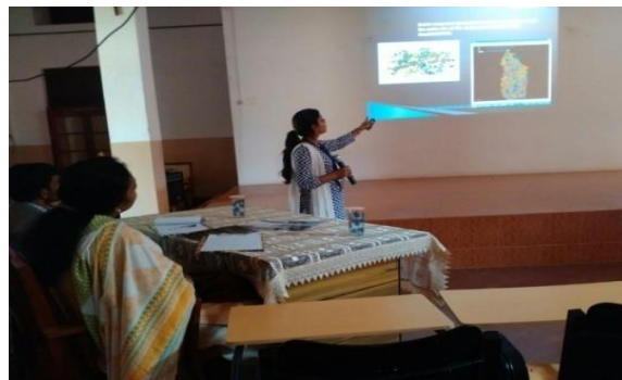
BioInformatics Students @ Mercy College, Palakkad – 05.01.2017