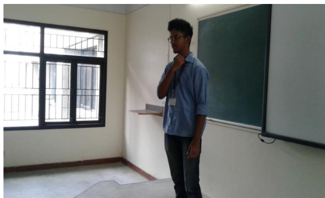
Student @ Snap Talk – 02.01.2017