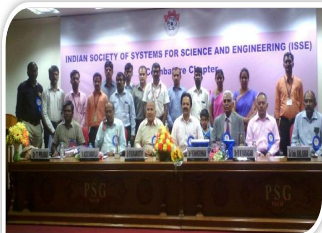
ECS Faculty @ ISSE – ISRO Inauguration – 06.01.2017