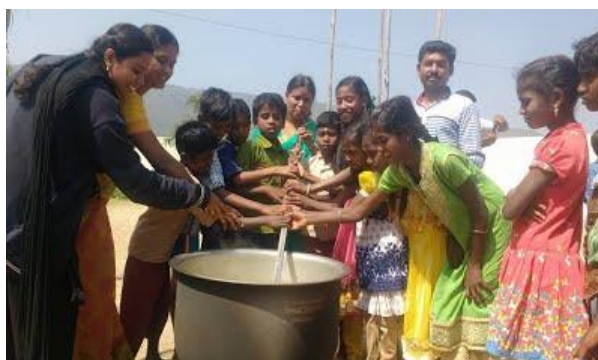
MSW Students Pongal Celebration @ tribal village, Nagalur – 15.01.2017