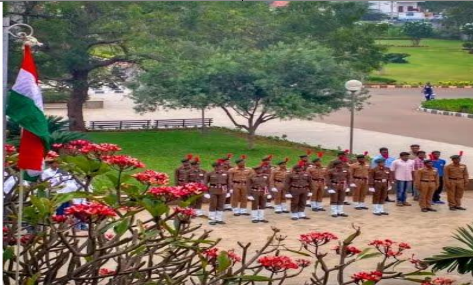
Republic Day Celebration – 26.01.2017