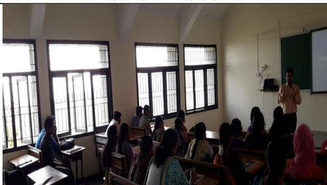
Seminar @ IT – 27.01.2017