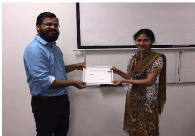
B. Com (CA) Alumni received "Young Achiever Award" @ Oracle – 02.01.2017