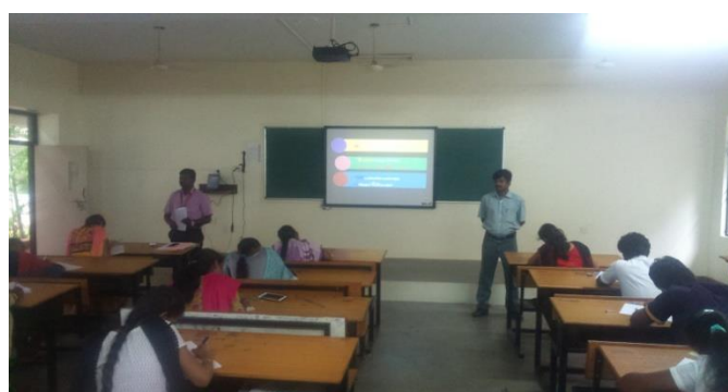
Essay Competition @ College Day Events – 29.01.2017