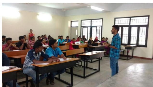
Alumni Interaction @ CS– 27.01.2017