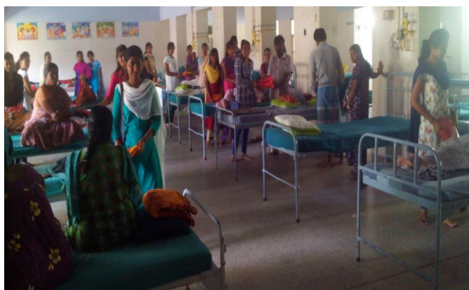
CDF Students @ GH – 01.01.2017