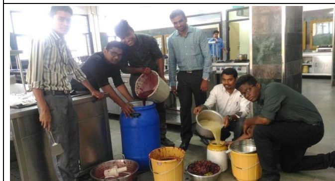
Wine Making @ CSHM – 26.01.2017