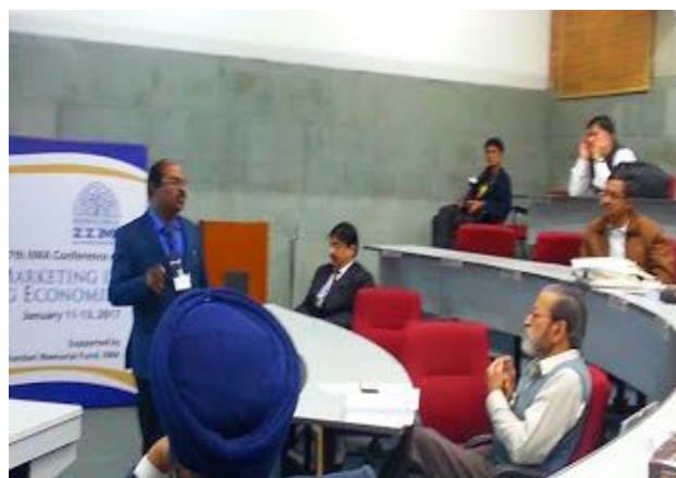
Principal @ IIM, Ahmedabad– 11.01.2017