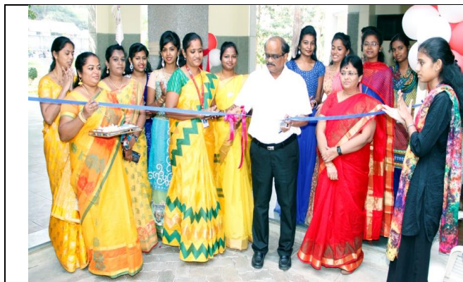
EXPO @ CDF – 09.01.2017 & 10.01.2017