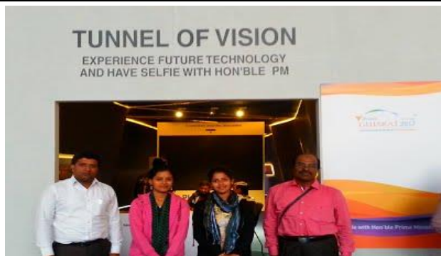
BBA Students @ Technology Vision submit, Ahmedabad – 13.01.2017