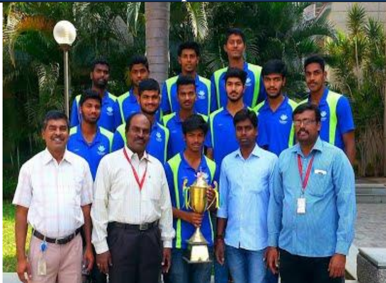
Volleyball team won the runner-up @ Coimbatore District Championship League– 09.01.2017