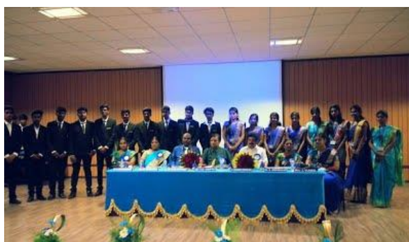
National Conference @ Commerce Streams – 06.01.2017