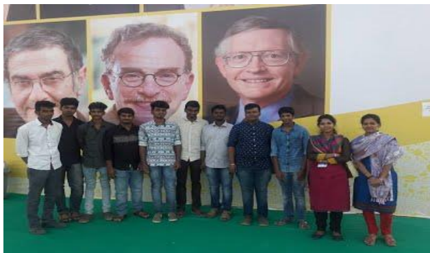
BBA students @ Gujarat – 10.01.2017