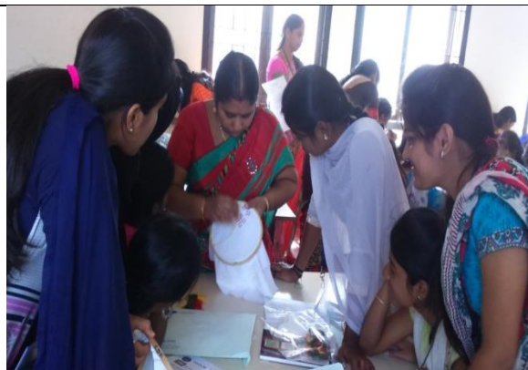
Workshop @ CDF – 06.01.2017 & 07.01.2017