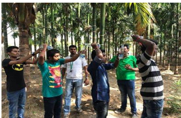
CSHM students @ Rural camp-07.01.2017