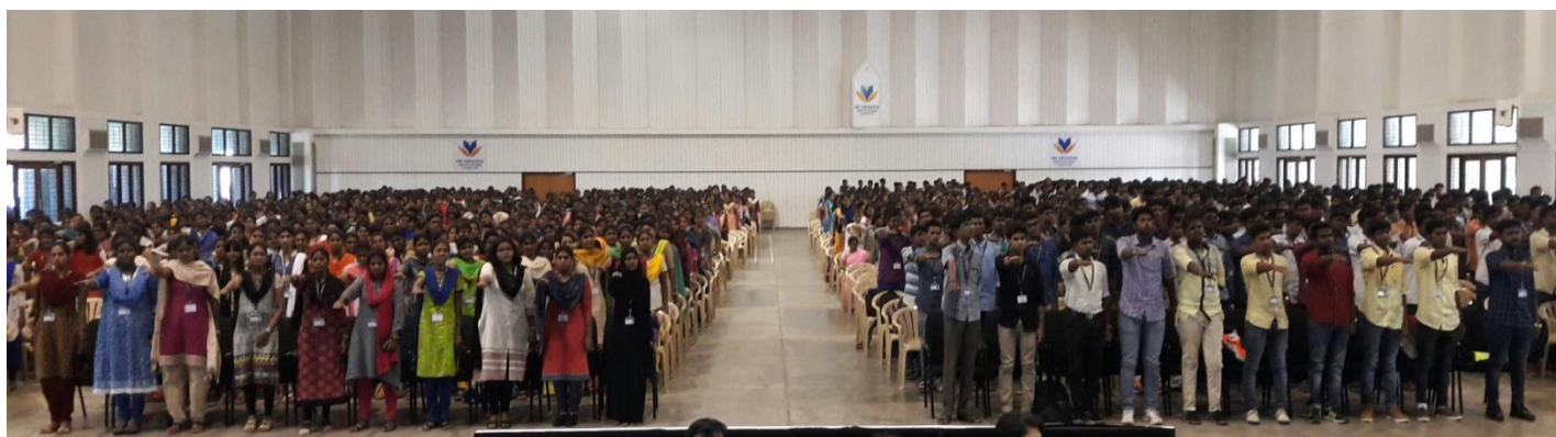
SKASC Students took Anti-Ragging pledge – 05.06.2017