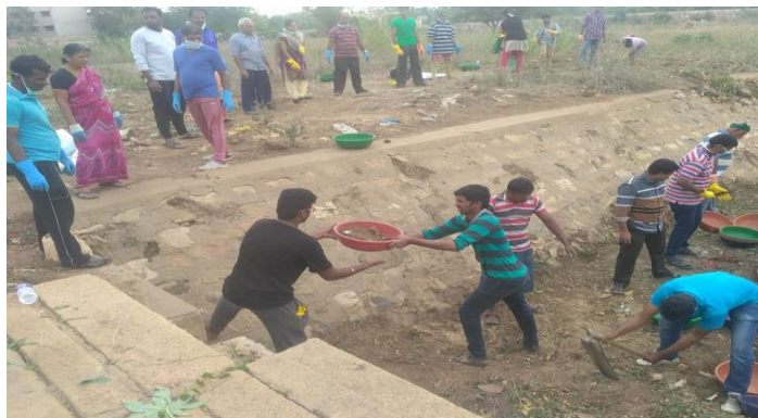
NSS students in renovation work, Noyal River basin– 24.06.2017