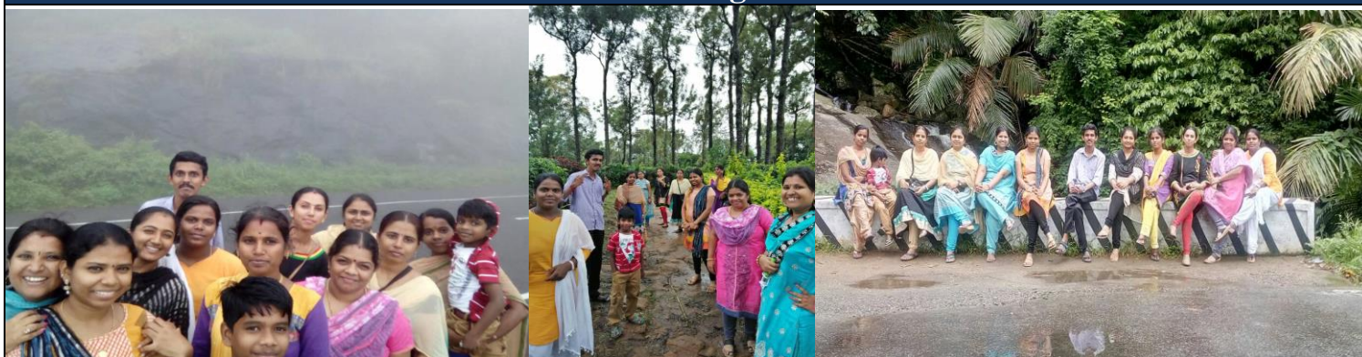
Faculty Recreation Programme - CS @ Nelliampathy - 24.06.2017