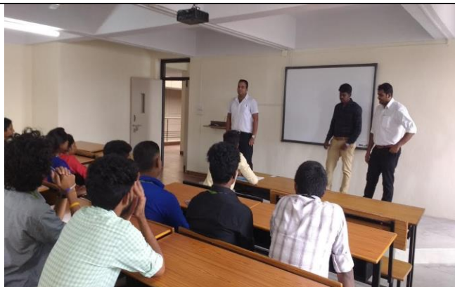
Campus to Corporate @ MSW- 08.06.2017