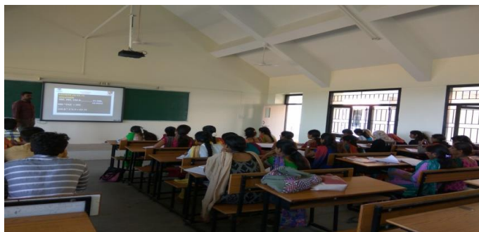
Aptitude Test @ IT – 17.06.2017