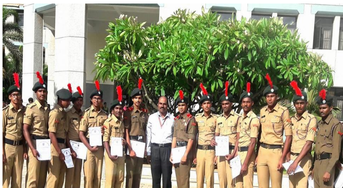
18 NCC Cadets of SKASC received ranks in the NCC Camp – 20.06.2017