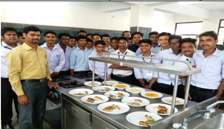
Workshop on preparation of Italian dishes @ CSHM – 29.06.2017