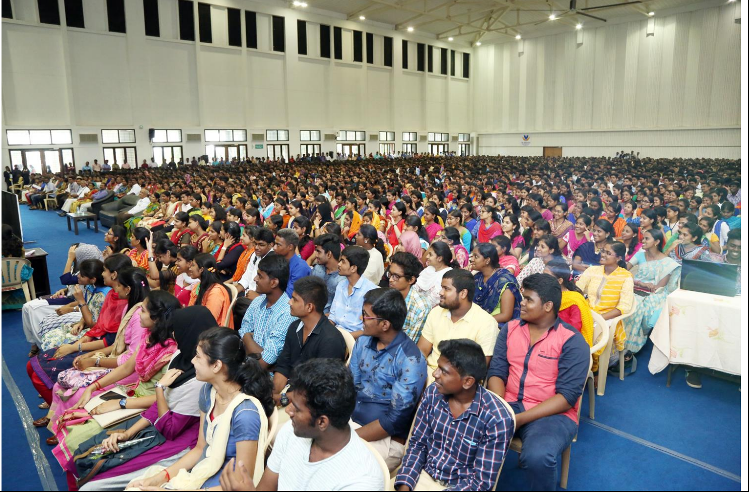
Fresher's Day - 16.06.2017