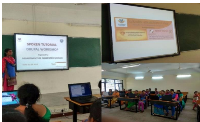
Drupal FDP on 02.06.2017