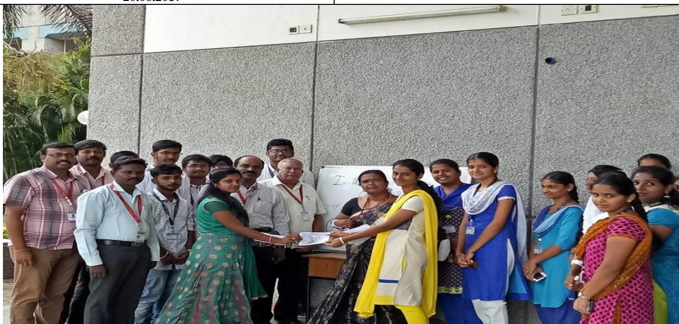
SKASC students in Anti-Alcohol Campaign – 27.06.2017