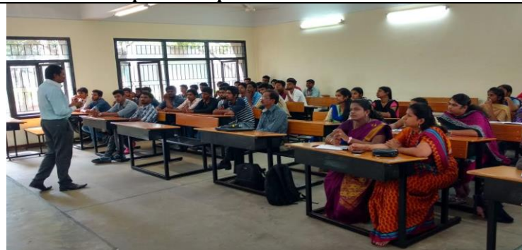
Big Data Seminar @ CS – 17.06.2017