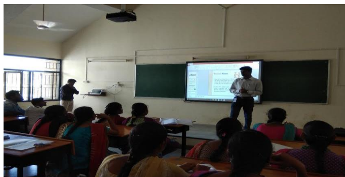
Software Testing Seminar @ CS – 22.06.2017