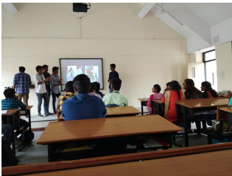
CSA & SS - Edutainment Program on Java Programming on 31.8.2018