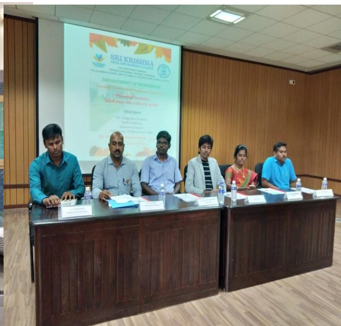
DEPARTMENT OF BIOSCIENCES GUEST LECTURE ON 10.8.18