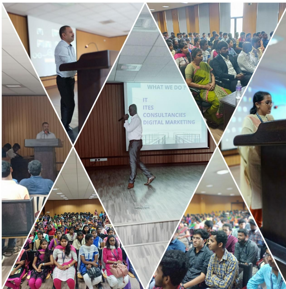
IT - One day seminar on “Internet of Things” on 28/8/2018